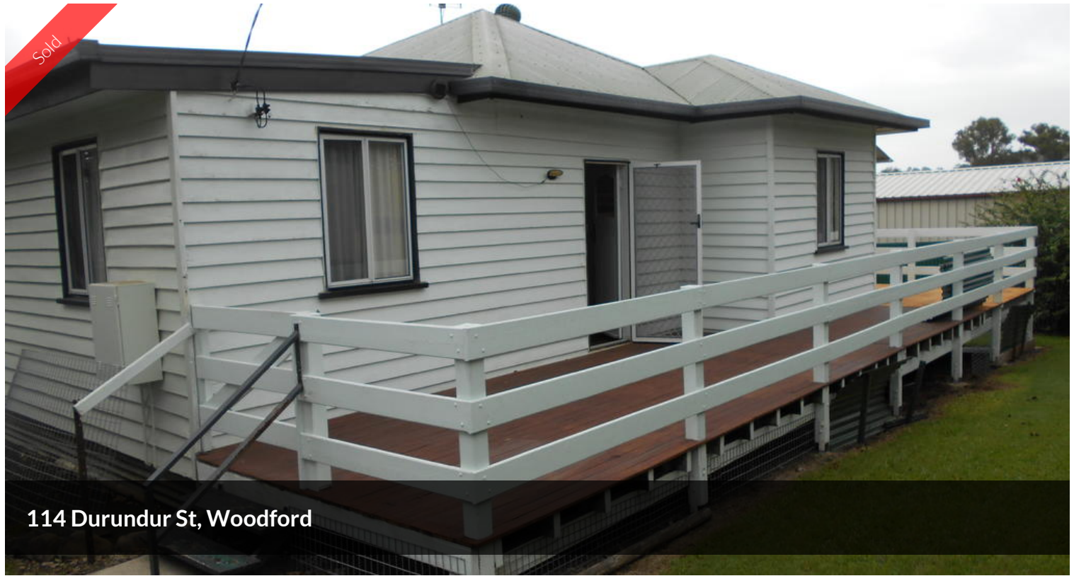
114 Durundur St, Woodford