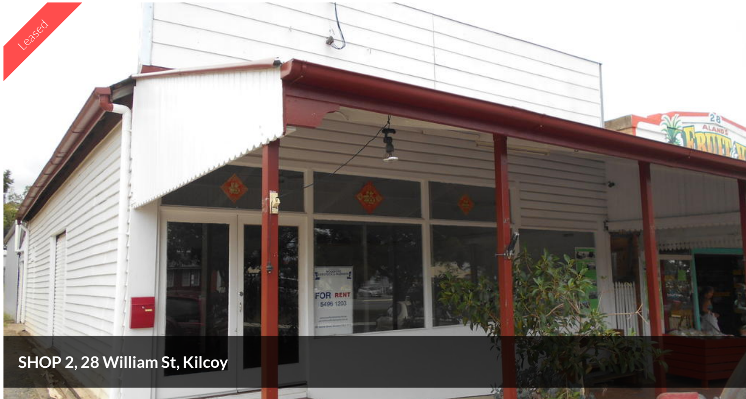
SHOP 2, 28 William St, Kilcoy