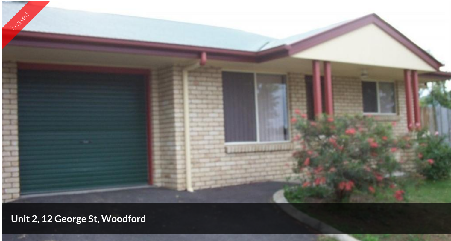
Unit 2, 12 George St, Woodford