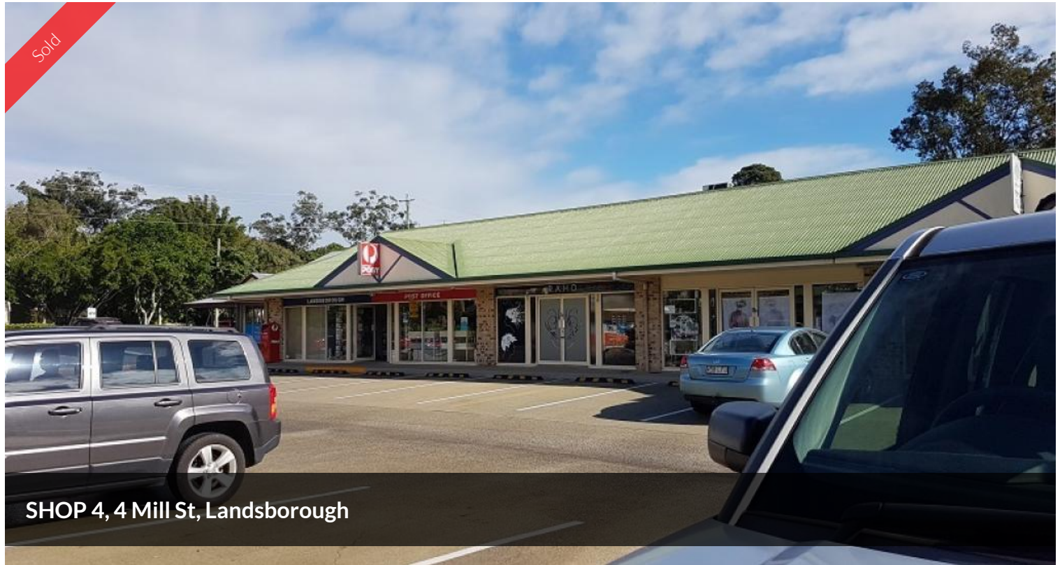
SHOP 4, 4 Mill St, Landsborough