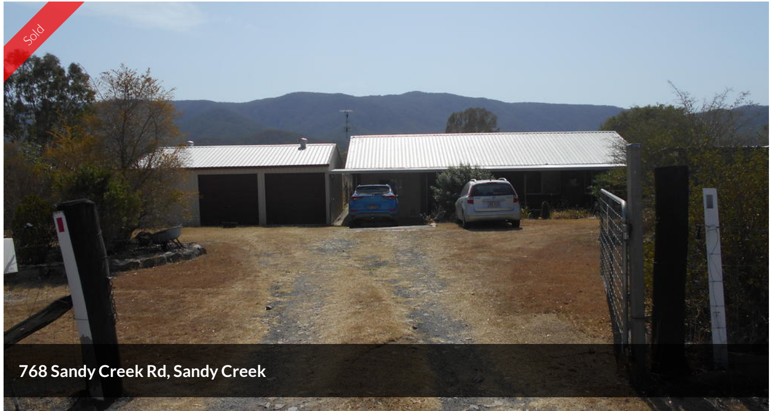
768 Sandy Creek Rd, Sandy Creek